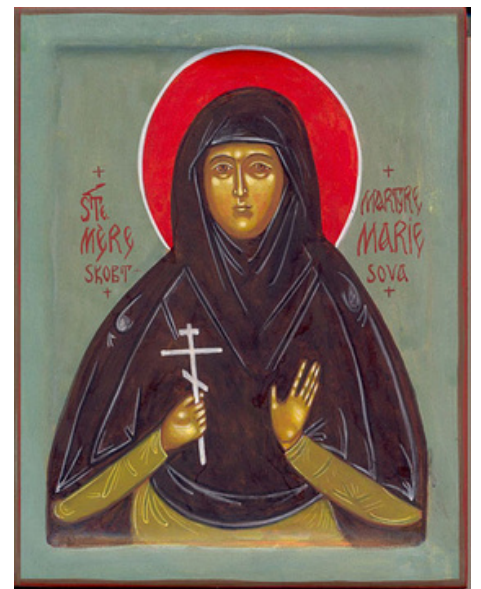
Mother Maria Skobtsova July 20