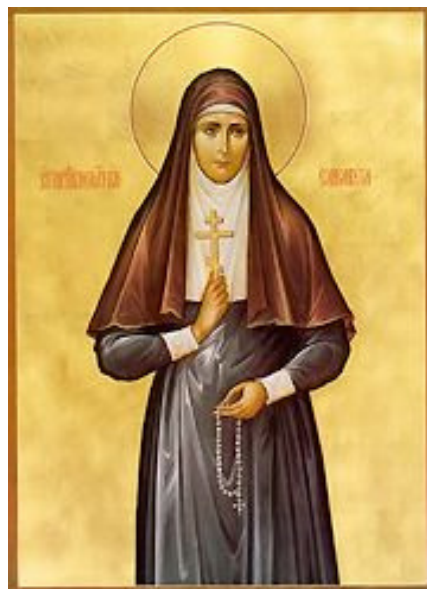
St. Elizabeth the New Martyr July 18